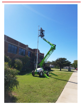
Friends working during the first work day of Project #2